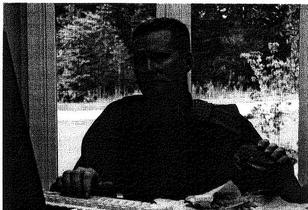
Of major importance to pharmacists is that persistence with statin therapy is poor.

the incidence of statin-induced rhabdomyolysis is higher in practice than in controlled trials in which high-risk patients are excluded. 30 The risk of myopathy with statin treatment increases with co-administration of drugs that inhibit statin metabolism (Box 1). 31 In fact, when muscle damage does occur with statins, it is commonly the result of drug interactions rather than a specific adverse response to statin monotherapy. 32 Such interactions inevitably result in higher plasma concentrations of a statin and thereby an increased risk of myopathy. Multiple drug use, drug interactions and altered drug metabolism may put the elderly patient at increased risk of myopathy when statins are administered. 32 Some caution is therefore advocated in the use of these drugs in elderly patients. 33 Accepted risk factors for rhabdomyolysis include age (particularly > 80 years of age); small body frame and frailty; renal, hepatic and thyroid dysfunction; and hypertriglyceridaemia. 29 Recent data also suggests that exercise, Asian race and peri-operative status may also increase the risk of muscle toxicity. 29 Some patients may also be genetically predisposed to statin rhabdomyolysis. The incidence of rhabdomyolysis seems similar among patients taking atorvastatin, pravastatin and simvastatin, although no study has been powered to provide a definite comparison. 30,34 Controversy exists in this area, with some analyses suggesting that simvastatin and rosuvastatin may have higher rates of