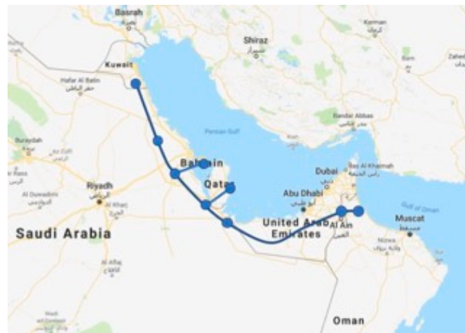
Figure 1. Gulf Cooperation Council's (GCC) Interconnection Project [34].

To manage the project, the Gulf Cooperation Council Interconnection Authority (GCCIA) was established in 2001. The project was implemented through 3 phases as follows: