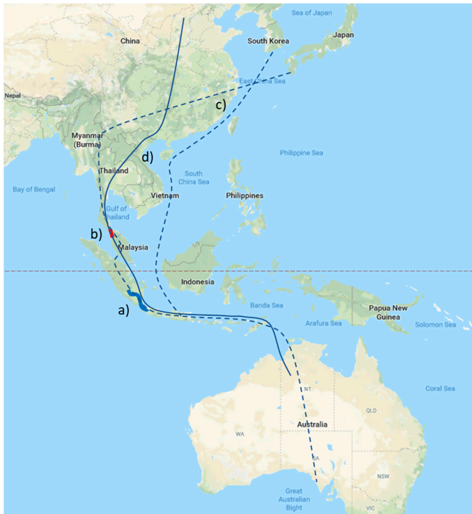
Figure 3. Two proposed routes for the Pan-Asian Energy Infrastructure scenario—Under consideration/development: transmission path of the ISJ, Section 3.2.2 (a), existing: Thailand (Khlung Ngae)—Malaysia (Gurun), Section 3.3.6 (b) and proposed (c,d) transmission links that could form an Asian electricity grid.

Another scenario, known as the Asia Pacific Super Grid (Figure 3) aims at promoting large-scale solar electricity exchange among countries involved. In this scenario, one third of the electricity is to be provided from Australia’s solar through HVDC cable by 2050 “on the basis that it is substantial but would still allow room for diverse electricity sources within each country to maintain robustness”. The scenario relies upon short term pumped hydroelectric storage with significant capacity for maintaining reliability including solar energy intermittency mitigation [59].