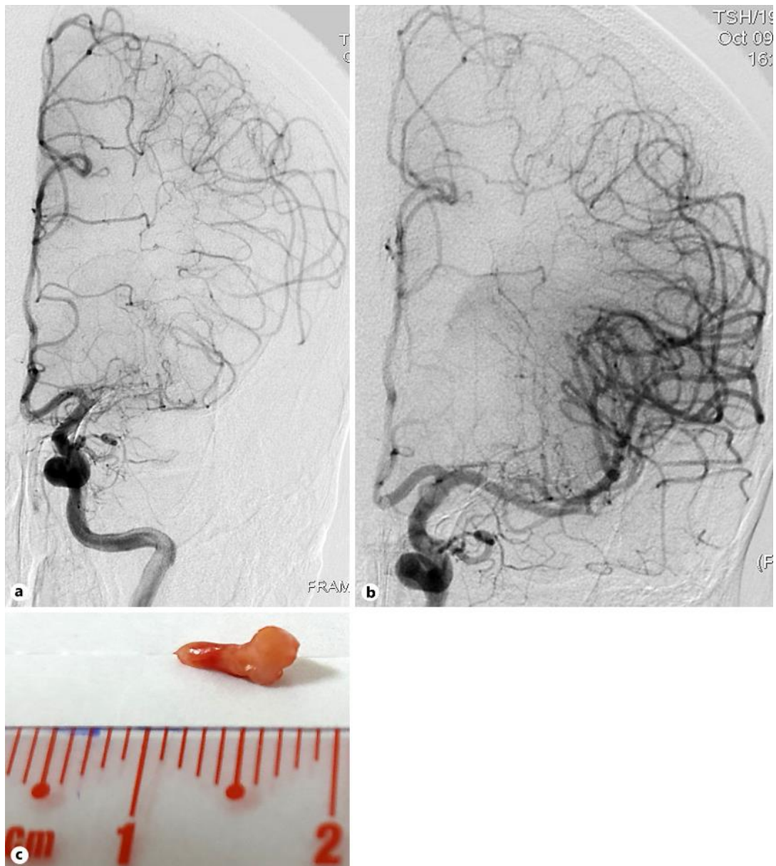
Fig. 3. Before and after MT. a Occlusion of the proximal M1 MCA. b After recanalization: complete reperfusion TICI 3. c Clot specimen removed from the M1 segment. MCA, middle cerebral artery; MT, mechanical thrombectomy.