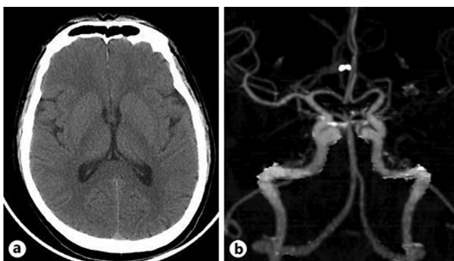
Fig. 1. Angiography of the anterior circulation. a Noncontrast CT with no hemorrhage, ASPECTS of 10. b CT angiography: occlusion of the proximal left MCA artery. ASPECTS, Alberta Stroke Program Early CT Score; CT, computed tomography; MCA, middle cerebral artery.