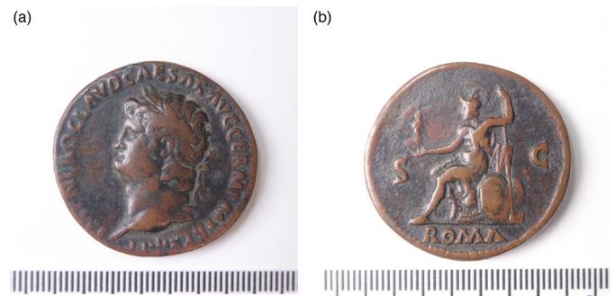
Figures 4a and b: Bronze Sestertius of Nero. Otago Museum Collection. E2017.544