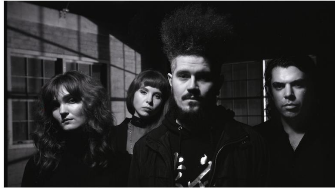
Innovative four-piece band Forver create spooky future/shoegaze that's "stylish to the point of being ostentatious".

EDGE RADIO RECOMMENDED: FOREVR - 'CLASSICS'/'DEATH IS A MIRACLE'