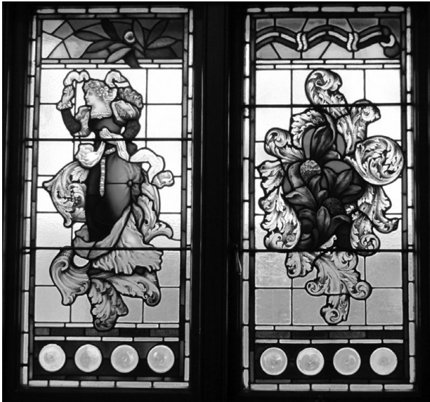
Fig. 5. Stained glass windows in 'Huonden' Hobart, home of the Alan Cameron Walker, architect of the original St Alban's church.

Winter (1996) stated that 'The maker of the stained glass windows is unknown' but surmised that the design may have originated with Alan Cameron Walker, the architect for the church.