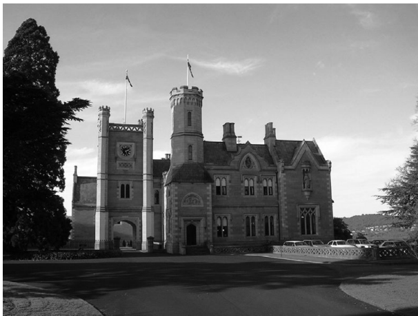
Fig. 2. Government House, Hobart, home of Lady Ellison-Macartney, Robert Falcon Scott's sister.