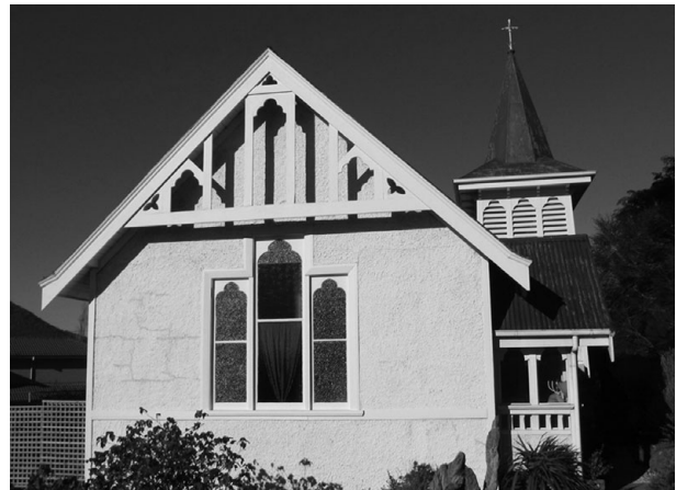
Fig. 3. Original St Alban's church Claremont showing the rear wall where the stained glass window was originally installed.

Although the weather was wintry on Sunday, there was a large congregation at St. Albans, the little Anglican Church